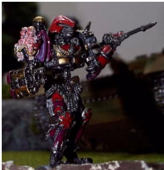
A large robotic walker

Each weapon takes up very little space on the Unit Sheet. I have isolated out below the three lines that can be used to describe any weapon you care to make (you don't believe me, but you will...).