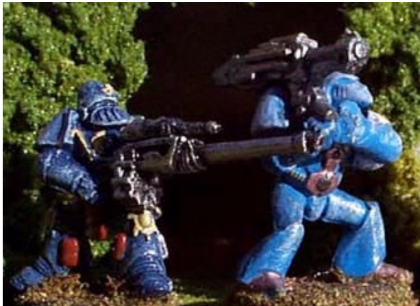
Two Models in Power Armor; one with a waist mount weapon and the second with a shoulder mount weapon.