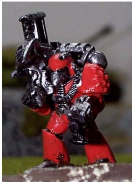
Power Armor with shoulder Mount Weapon And 1 handed weapon

When you determine the final cost of a unit, it must include all weapons used by the unit. A unit that has multiple weapons per model gets very expensive very quickly.